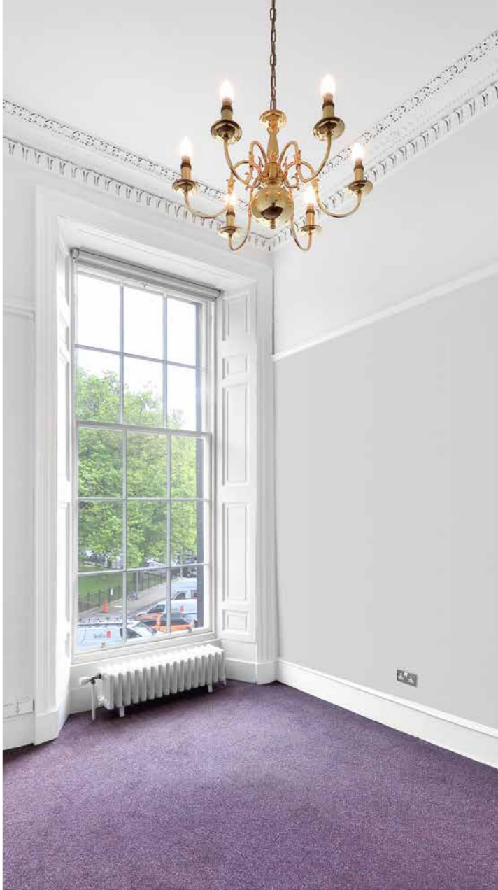
FIRST FLOOR OFFICES