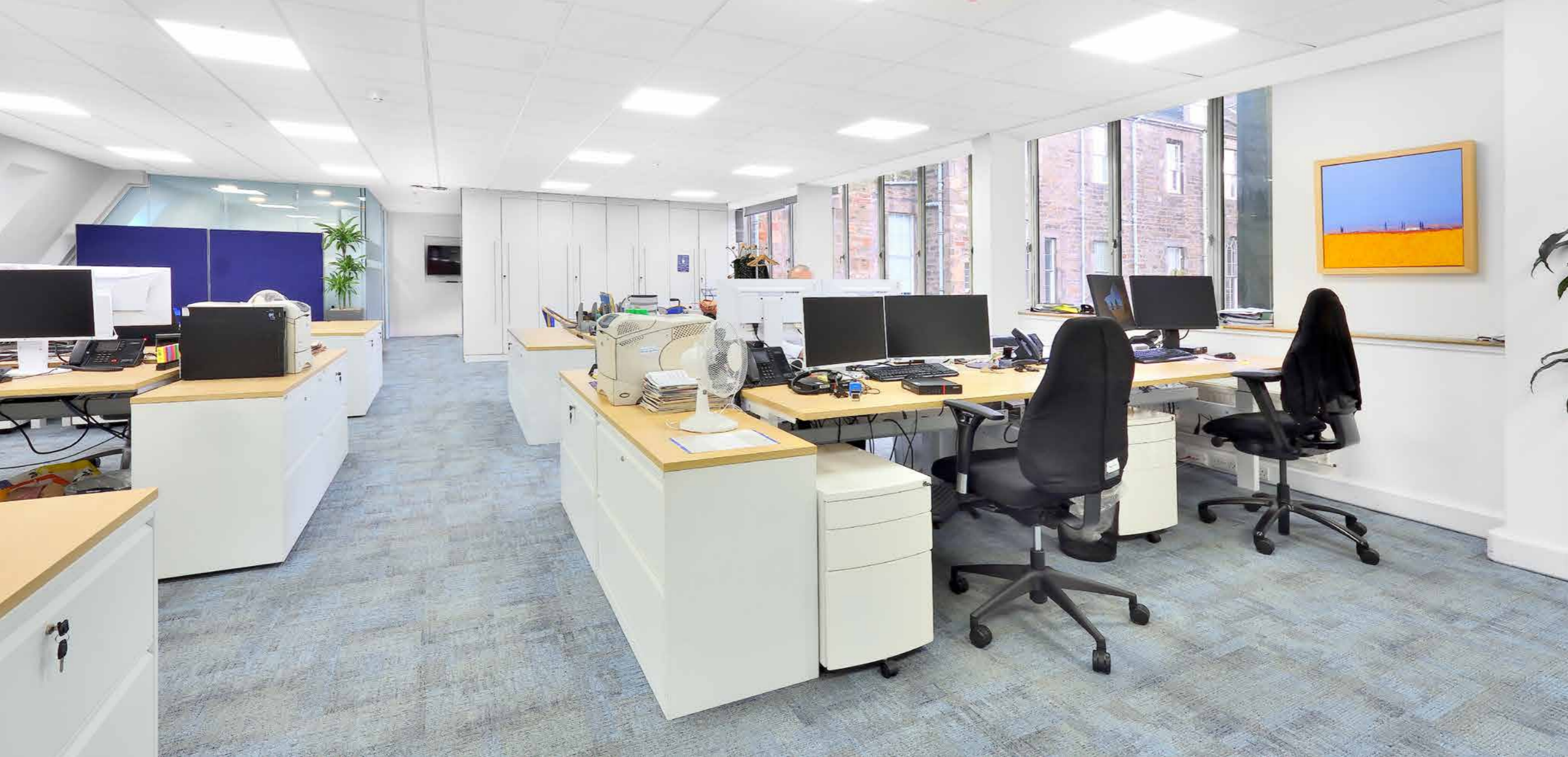
FIRST FLOOR OFFICES